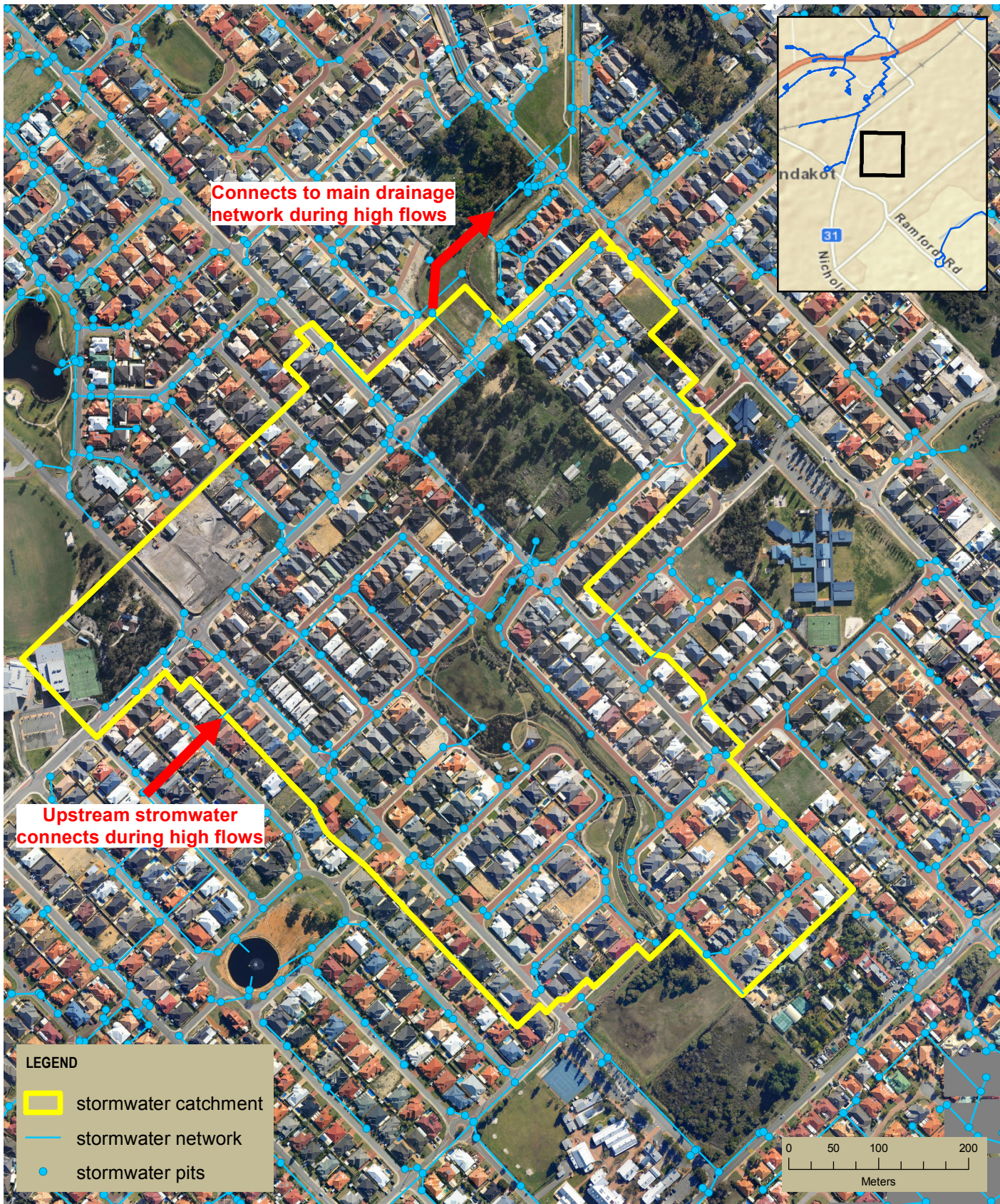
Figure showing simplified stormwater catchment for Cromarty Garden Reserve in Canning Vale